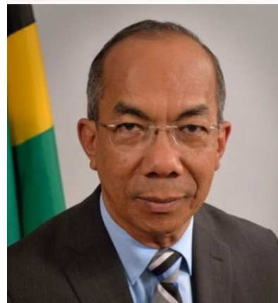
The Honourable Dr. Horace Chang Minister of National Security

The Ministry of National Security and all its departments and agencies are committed to maintaining the environments that allow Jamaica's celebrated values and truths to remain our identifying factor as a country.