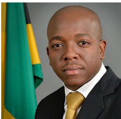
Senator Parnell Charles Jr. Minister of State, Ministry of Foreign Affairs and Foreign Trade

It is my distinct pleasure to welcome you home on behalf of the Government of Jamaica.