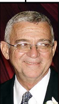
Rev. Ronald Thwaites - Education