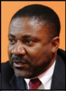
Dr. Phillip Paulwell - Mining and Energy