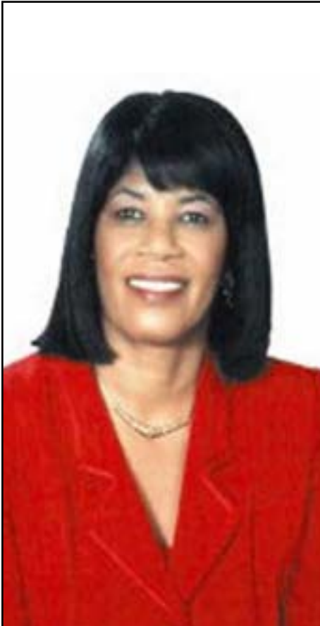
Mrs. Portia Simpson Miller - PM and Minister of Defence