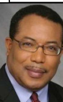
Mr. Anthony Hylton - Industry, Investment and Commerce