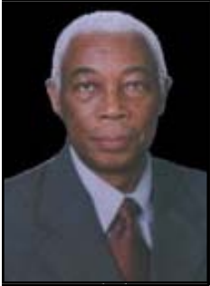
Sen AJ Nicholson - Foreign Affairs and Foreign Trade