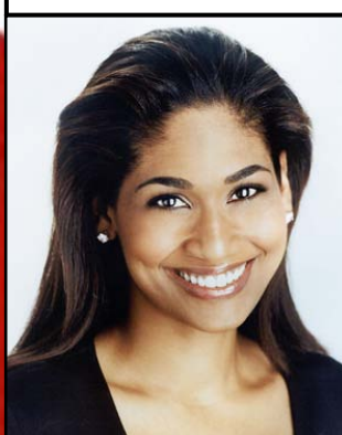
Ms. Lisa Hanna - Youth and Culture