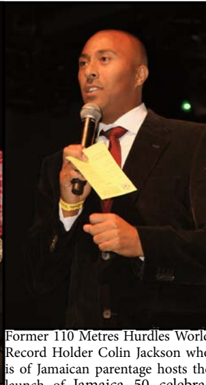
Former 110 Metres Hurdles World Record Holder Colin Jackson who is of Jamaican parentage hosts the launch of Jamaica 50 celebrations at the O2 in December.