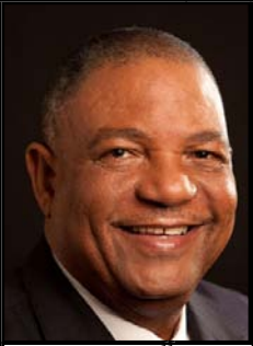
Mr. Horace Dalley - Public Service