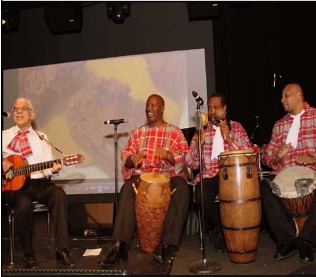
Mento Band performing at the launch of Ja 50 at the O2 in December