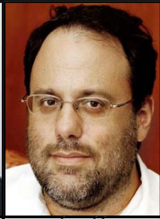
Sen Mark Golding - Justice